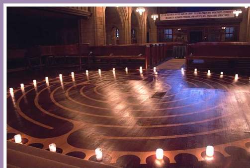
Our new labyrinth in the FCC Sanctuary

Open Labyrinth Walks Every Wednesday from 6:00-8:00pm in the Sanctuary.