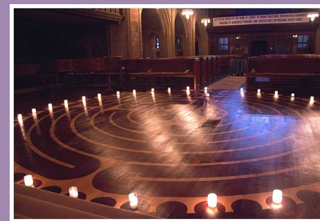
Our new labyrinth in the FCC Sanctuary

On-going Wednesdays Sept.5-May 22 from 6 to 8pm. in the Sanctuary.